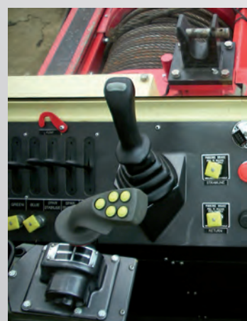
Single Lever Joysticks for Winch Control

* All Brightwater products are subject to a continuous improvement program, specifications may change without prior notice.