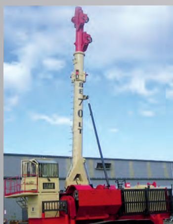
70ft (21m) Telescoping Tower