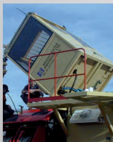
Hydraulic Tilting Cab