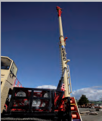
85ft (26m) Telescoping Tower