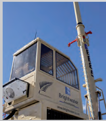
OPS & FOPS Rated Air Conditioned Cab