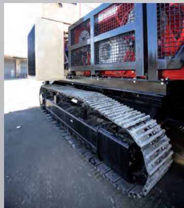
Strong Purpose Built Undercarriage