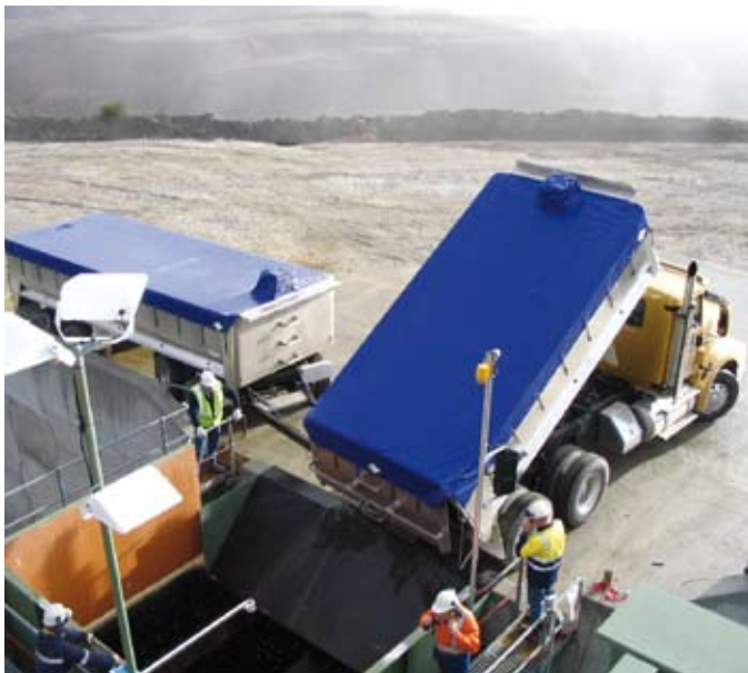
Concentrate receival hopper being loaded