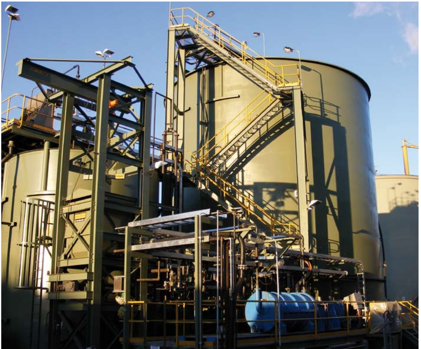
Ore concentrate repulping and processing plant

Oceana Gold, Macreas Flat, Otago, New Zealand 2007