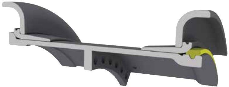
MES IGLR assembly (to be used with DGS)