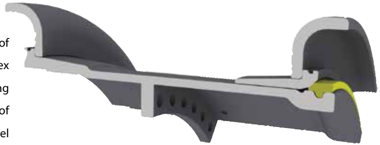
5 piece MES assembly

Components are fully machined from rolled steel or seamless forgings to ensure optimal roundness; providing an exact fit of rim components and tire bead. The tire bead has 75% more contact area on the rim to seal air in the tire, preventing air loss and reducing tire slippage.