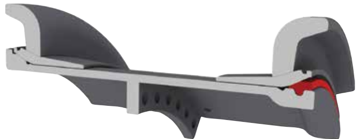
TSR IGLR assembly (to be used with DGS)