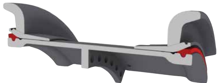
TSR DGS assembly (position sensitive outer dual wheel)