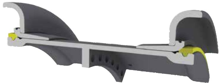
MES DGS assembly (position sensitive outer dual wheel)